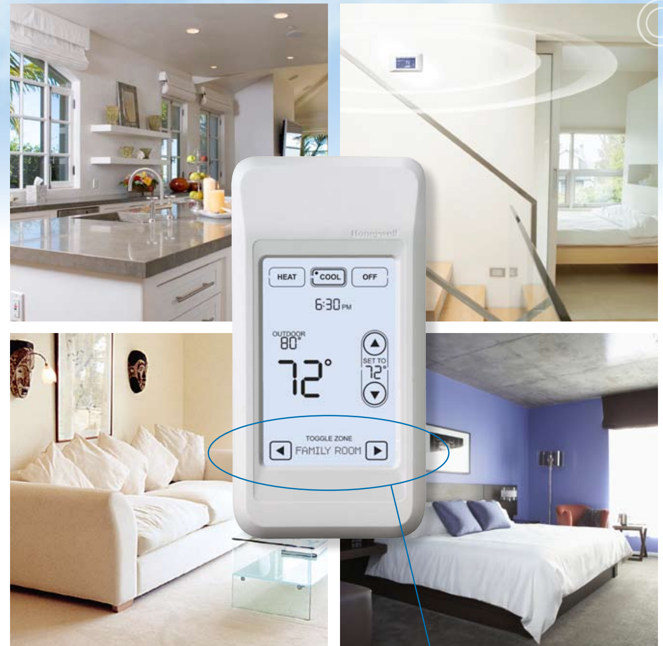
Toggle between zones to set the temperature in any zone from anywhere in the home

The Portable Comfort Control also maintains the schedule from your programmable thermostat. Easily adjust the temperature setting before bedtime to set-back for energy savings after you fall asleep — or turn the system off for easy overnight energy savings.